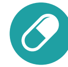
PART D Prescription Drug Coverage